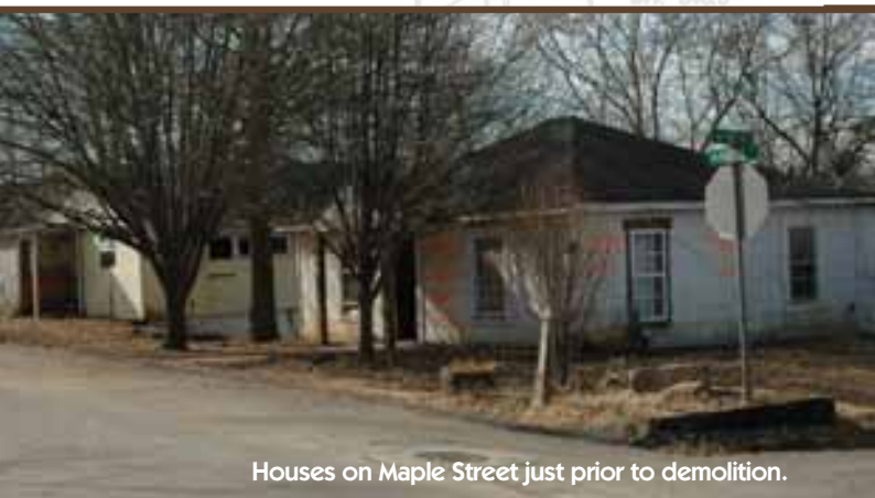
Houses on Maple Street just prior to demolition.

When the plan for the housing complex is fully imple