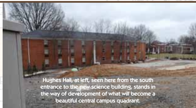
Hughes Hall, at left, seen here from the south entrance to the new science building, stands in the way of development of what will become a beautiful central campus quadrant.