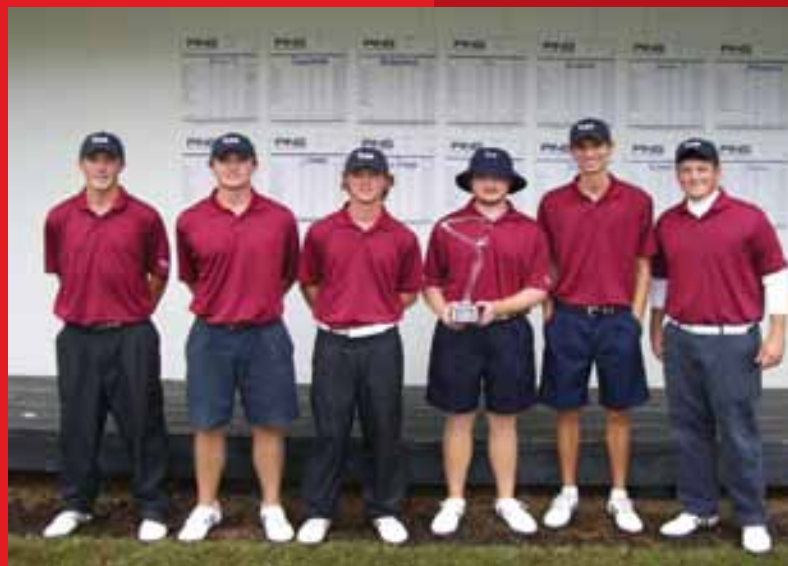
Lee golf team captured Chick-fil-A title in Rome, Ga., this past fall