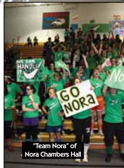
"Team Nora" of Nora Chambers Hall

Of the teams that competed, it was the first year that Carroll Courts, the married students housing complex, fielded a team. In addition, the men of Hughes Hall were an especially united group as they played with extra passion, armed with the knowledge that this was the last year of Dorm Wars competition for Hughes Hall as it is currently known. Hughes is slated for demolition later this year.