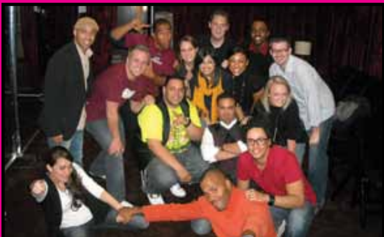
Voices of Lee developed a close bond with the members of NOTA, the all-male group from Puerto Rico that eventually won the Sing-Off competition. Like Voices, NOTA was a highly spiritual ensemble and the two groups spent much time backstage harmonizing together to their favorite gospel tunes.