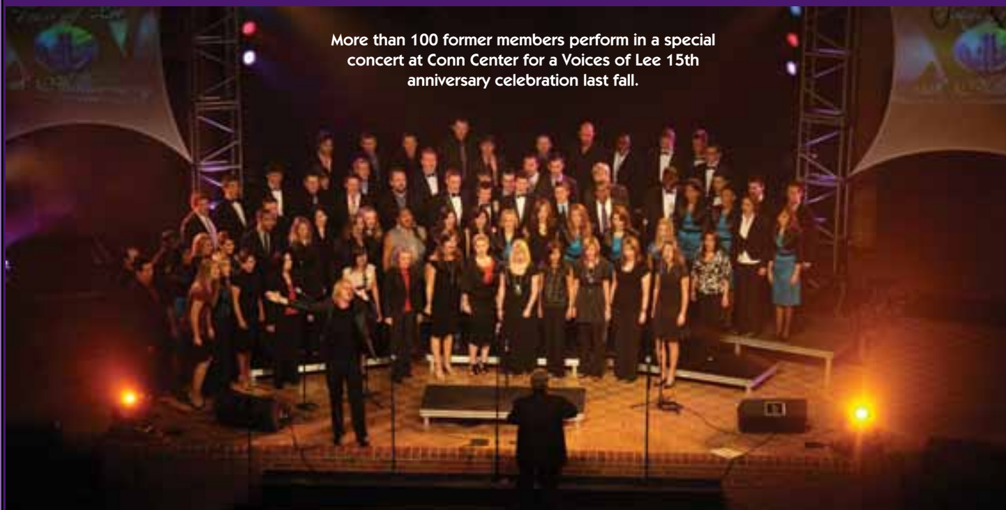
More than 100 former members perform in a special concert at Conn Center for a Voices of Lee 15th anniversary celebration last fall.