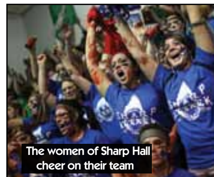
The women of Sharp Hall cheer on their team