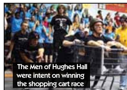
The Men of Hughes Hall were intent on winning the shopping cart race