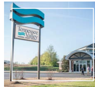
Tennessee Valley Federal Credit Union