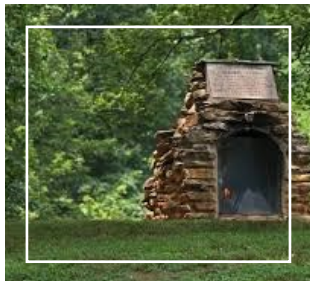
Red Clay State Park