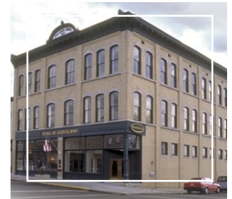
Bank of Cleveland