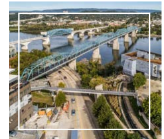
Walnut Street Bridge