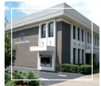
Andrew Johnson Bank