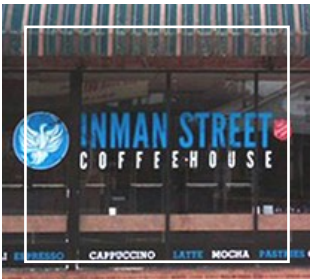
Inman Street Coffee