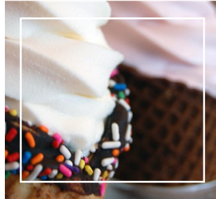
Perkits Frozen Yogurt