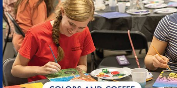
COLORS AND COFFEE